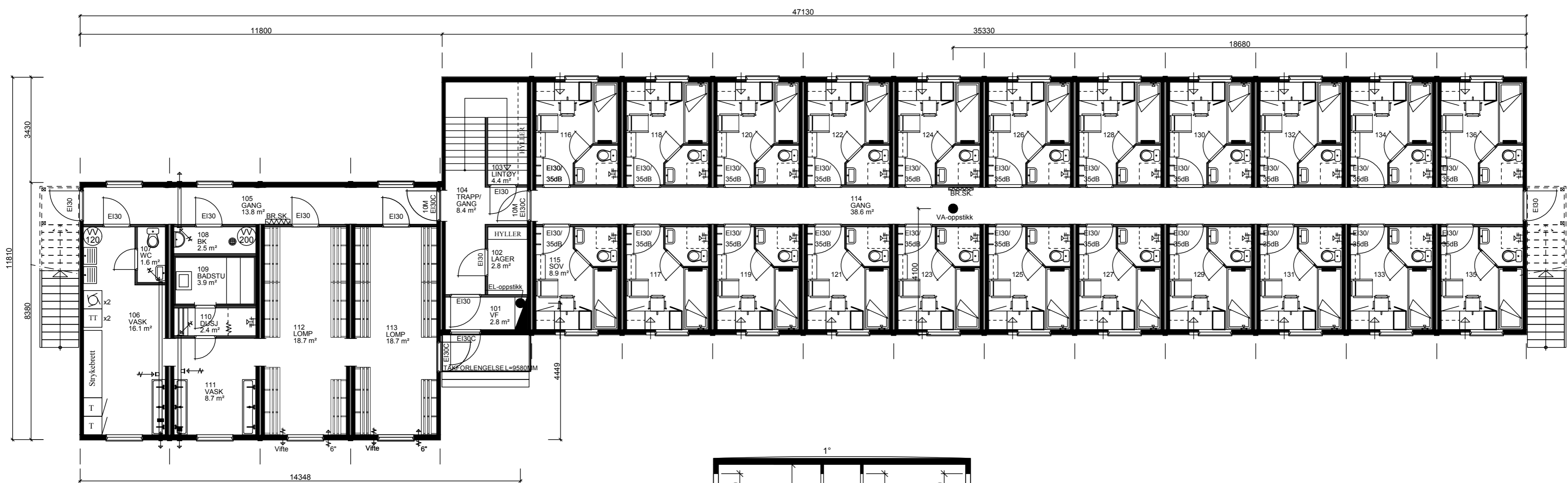
PLAN 1.ETASJE BTA : 395 m 2